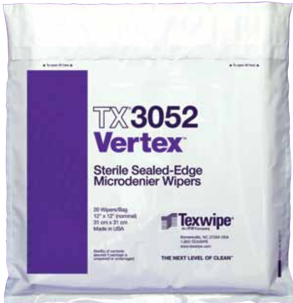
The Next Level of Clean™